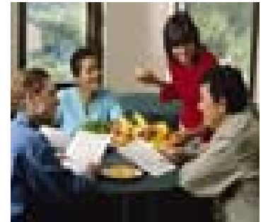
"National Agricultural Library, Agricultural Research Service, U. S. Department of Agriculture